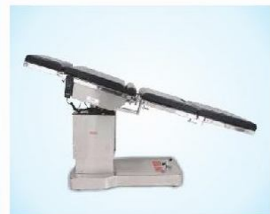
Trendelenburg / Ant-Trendelenburg