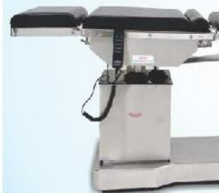
C - ARM