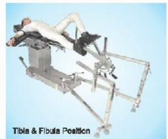
Tibia & Fibula Position

The attachment allows the positioning of the extremity as required in regard to the surgery practice and therefore is especially adapted to ensure safe and efficient.