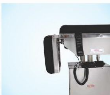
Head section adjustment (Up/Down)

Imported Electric linear actuators facilitates the various adjustment of positions. Hi-Lo elevation makes it easier for C-Arm fluoroscopy examination. With built-in kidney bridge suits for kidney operation. Optional traction for orthopedics extend functions of the table. 304G Stainless Steel die pressed cover along with the main body for anti-rust and corrosion.