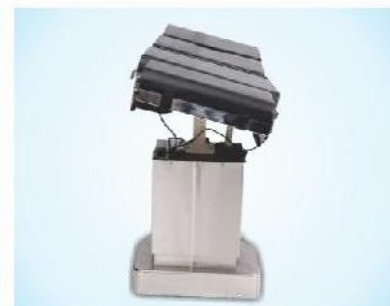
Lateral Tilt Left / Right