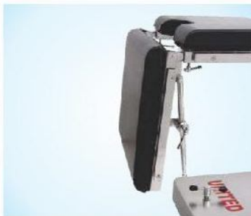
Leg section adjustment (Up/Down)