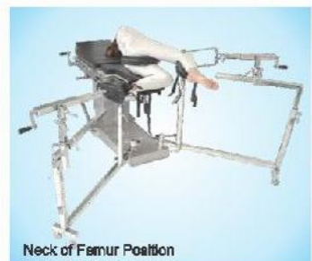
Neck of Femur Position