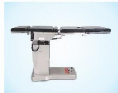
Tabletop elevation up/down