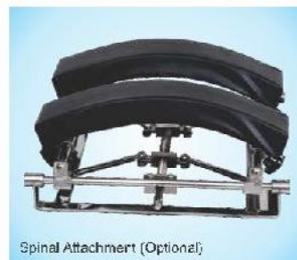
Spinal Attachment (Optional)